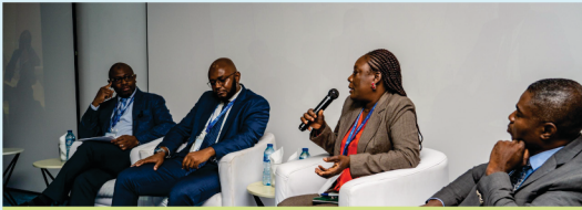
Representatives from different sectors participate in a round table discussion on Sickle Cell Disease Future Partnerships and Capacity for Sickle Cell Disease in Nigeria.