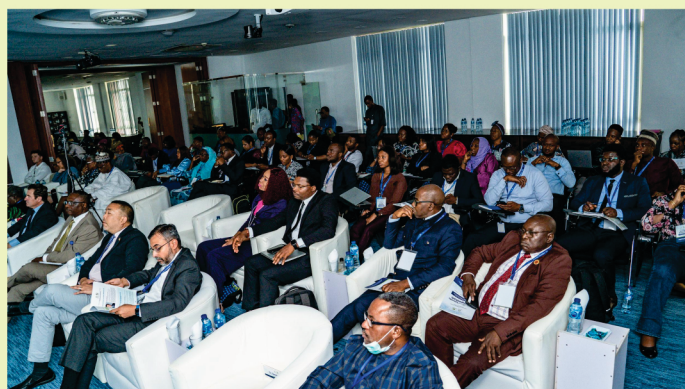
A cross-section of participants during a plenary session at the IRCE 2 nd Annual Scientific Symposium in the IHVN Campus, Abuja.