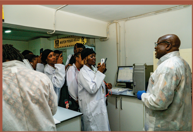
Medical Laboratory Students from the University of Abuja participate in a guided tour of laboratories in the IHVN Campus during a courtesy visit to the Institute to gain first hand insights into healthcare research.