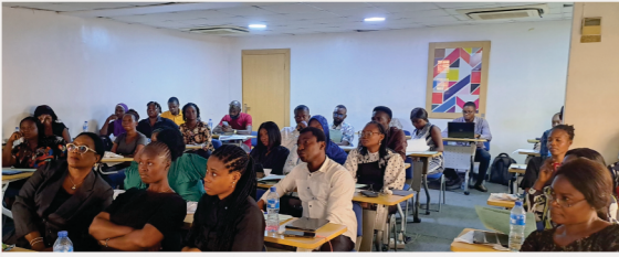
A cross-section of participants during one of the trainings on data reporting