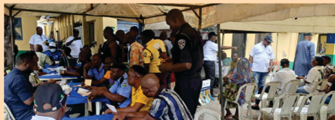
Police Officers gather for free medical services in a screening outreach in Area B Command headquarters in Apapa, Lagos State.

Sensitization activities were held monthly between July and September in PCRC Zone 2 Command Headquarters Onikan, PCRC Area C Police Command Surulere, PCRC Area G