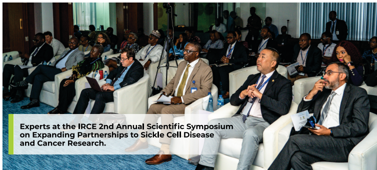
Experts at the IRCE 2nd Annual Scientific Symposium on Expanding Partnerships to Sickle Cell Disease and Cancer Research.